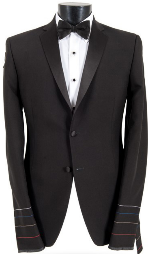
Slim & Ultra-Slim Try-On Coats from FCGI