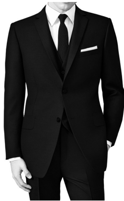
SLIM & TRIM