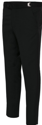
TRIM FULLER SEAT & HIP