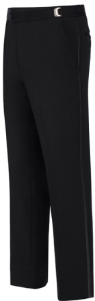
SLIM MOST POPULAR

Made from a stretch material for a fit that hugs the legs; not available in all sizes or ideal for all body types ±13.5" Ankle Width