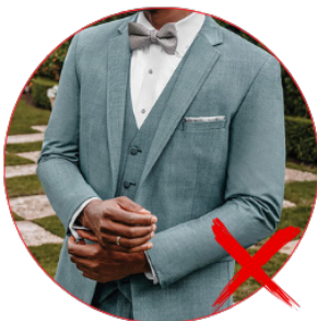
SECONDS ARE NOT: PERFECT/LIKE NEW

Paul Morrell 'Seconds' Program — The Paul Morrell 'Seconds' Program is where you can purchase off-rental stylish threads at a steal! This program gives you the chance to purchase lightly damaged garments that no longer meet our rental standards. But don't let that deter you - these items still have purpose life left in them and are good candidates for: