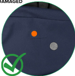
SECONDS ARE : LIGHTLY DAMAGED