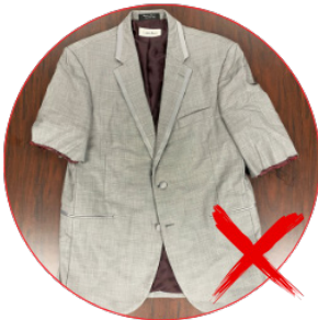
SECONDS ARE NOT: BADLY DAMAGED