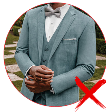
SECONDS ARE NOT: PERFECT/LIKE NEW

FOR MORE INFORMATION ON THE PM 'SECONDS' MERCHANDISE PROGRAM, ALONG WITH STEP-BY-STEP INSTRUCTIONS FOR CHECKING INVENTORY & PLACING YOUR ORDER ON PM ONLINE , PLEASE VISIT: PAULMORRELL.COM/PM-ACCOUNTS/SECONDS-PROGRAM/