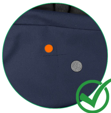
SECONDS ARE: LIGHTLY DAMAGED