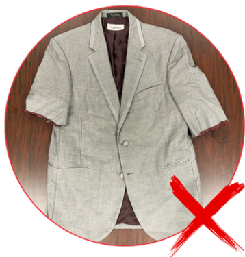
SECONDS ARE NOT: BADLY DAMAGED